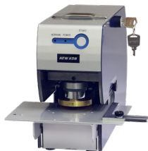
SecureSeal 70 Electric Embosser

Embossers create raised (dry) seals to legitimize original documents for Governments, Cities, Counties & Universities. Popular applications include: University Transcripts, Government Seals, Vital Statistic Seals, Engineering & Passports.