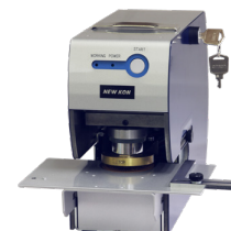
SecureSeal 70LR Long Reach Electric Embosser

We offer a variety of perforators and embossers to fulfill your security requirements.