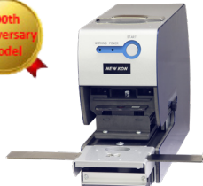
Model 15K Multi-Message Perforator