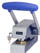
SecureSeal 60N Manual Embosser