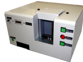
Auto Feed Card Perforator