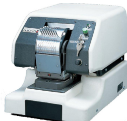
Model 112 Super Duty Perforator