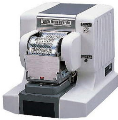
Model 10 Heavy Duty Perforator