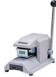
Model 206 Manual Perforator